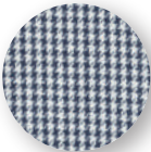
Blue/white dogtooth check (18)