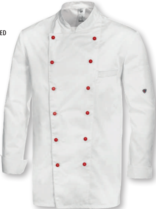
You can find BP® studs on page 211.