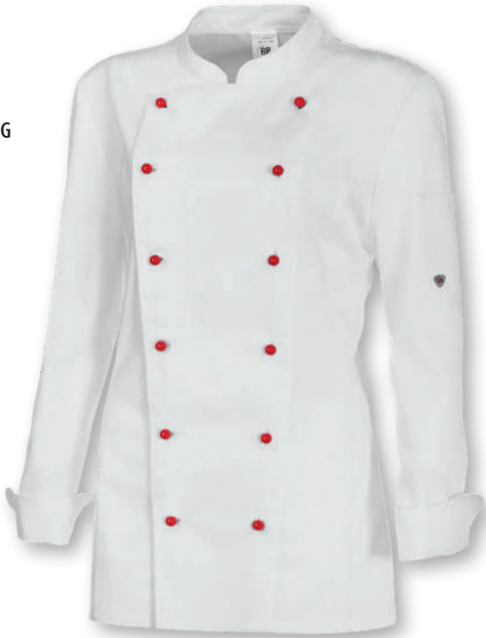
You can find BP® studs on page 211.

FEMININE DESIGN THANKS TO SHAPING SEAM LINES