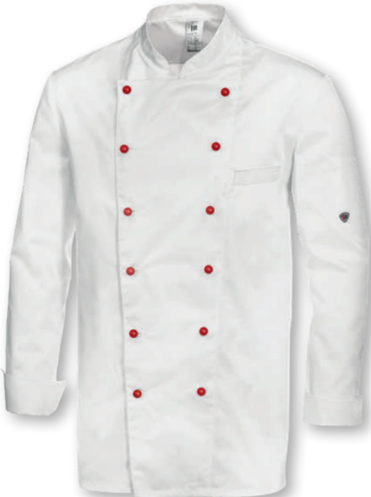
You can find BP® studs on page 211.

SUPER ELASTIC: 20% ELASTICITY, OUTSTANDING WEAR COMFORT