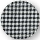
Black/white check pattern (33)