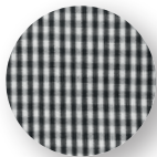
Black/white check pattern (33)

Sizes XSn-3XLn, Sl-2XLI (130), XSes-3XLes, XSs-3XLs, 2XSn-4XLn, XSl-3XLI (400-21), XSn-3XLn, XSl-3XLI (400-32, 400-0056, 801), XSs-3XLs, XSn-3XLn, XSl-3XLI (485)